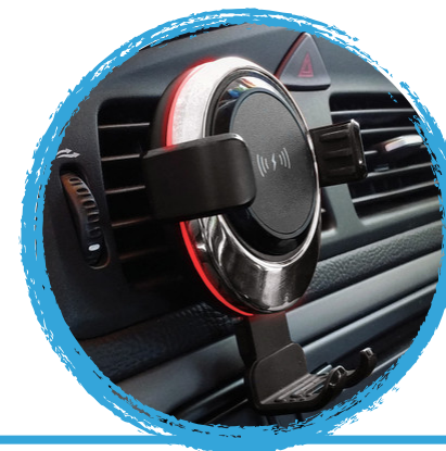
无线手机充电器 wúxiàn shǒujī chōngdiàn qì

我的生日就快来了， 你会买什么给我? wǒ de shēngrì jiù kuài láile, nǐ huì mǎi shénme gěi wǒ