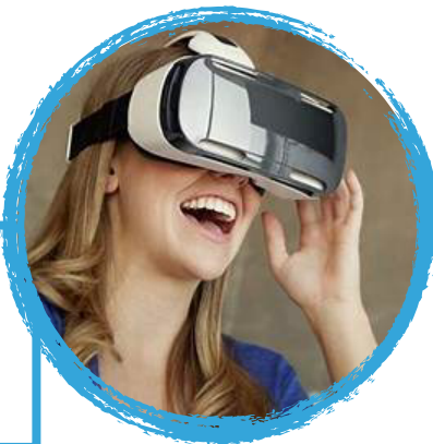
虚拟现实眼镜 xūnǐ xiànshí yǎnjìng