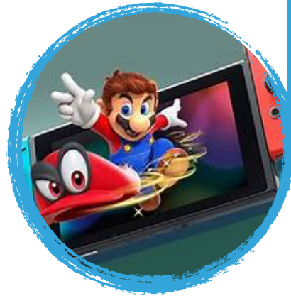
任天堂游戏机 rèntiāntáng yóuxì jī