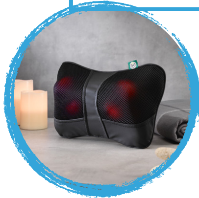
按摩垫 ànmó diàn