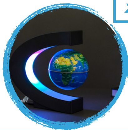
漂浮地球 piāofú dìqiú

我的生日就快来了， 你会买什么给我? wǒ de shēngrì jiù kuài láile, nǐ huì mǎi shénme gěi wǒ