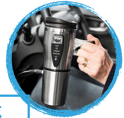
加热的旅行杯 jiārè de lǚxíng bēi