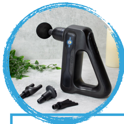
可充电的按摩枪 kě chōngdiàn de ànmó qiāng