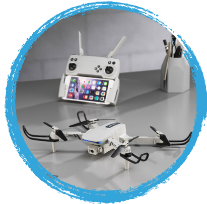
无人机 wú rén jī